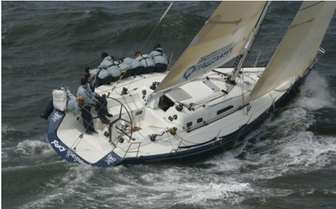
ABN AMRO North Sea Regatta 2005