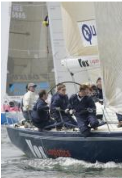
Photo AMRO North Sea Regatta 2006