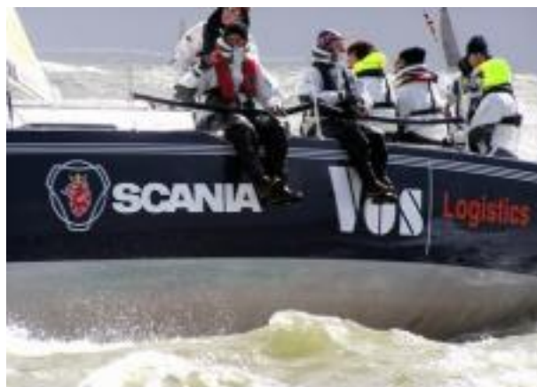
ABN AMRO North Sea Regatta 2006