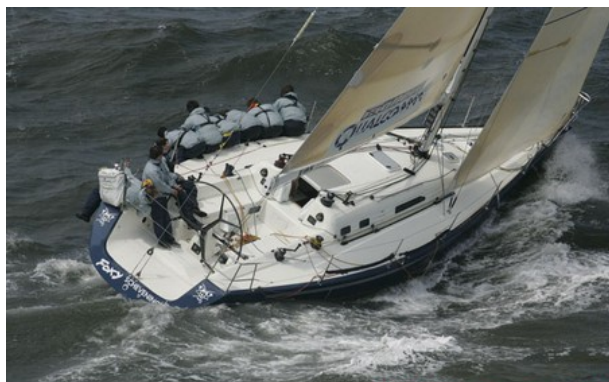
ABN AMRO North Sea Regatta 2005